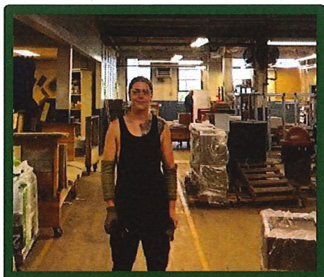
Explore Career Interests

Income: Does your family receive Medicaid, SNAP Benefits, Family Assistance, SSI or HEAP?